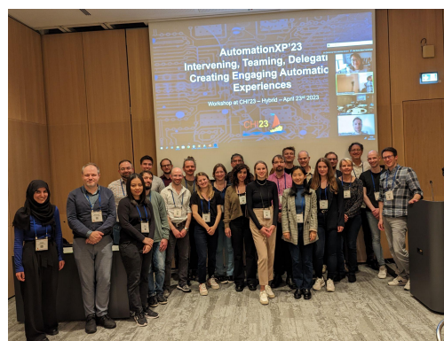
Images from the CHI'23 conference: Left - Opening ceremony, Right - AutomationXP workshop.

My participation in the AutomotionXP workshop was an enriching experience because it allowed me to interact with fellow researchers, exchange insights, and deliberate on topics of mutual interest. The workshop not only facilitated the dissemination of knowledge but also nurtured an environment conducive to meaningful interactions. Based on my participation and engagement, I wish to share some recommendations for future researchers considering participation in CHI conferences: